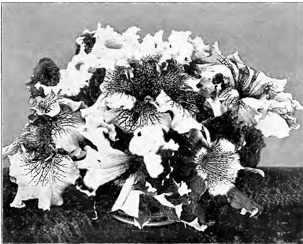
PETUNIA—GIANTS OF CALIFORNIA

TERMS: F. O. B. California terminal; flower and vegetable seeds, 60 days net or 2 per cent discount for cash within 30 days from date of invoice.